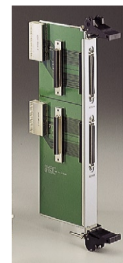
MIC-3646 Rear Transition Board